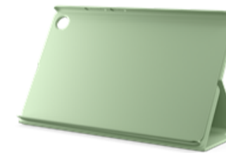
Lenovo Folio Case for Lenovo Tab One