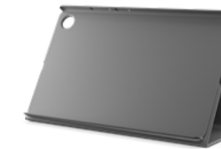
Lenovo Folio Case for Lenovo Tab One