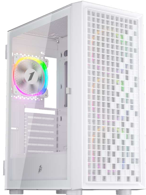
GAMING PC CASE GO6