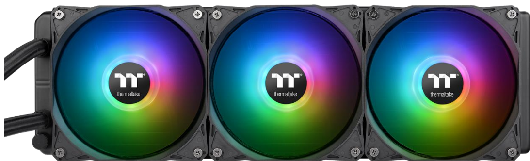
Powerful Cooling Fan