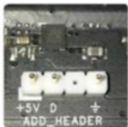
Aura Addressable Header