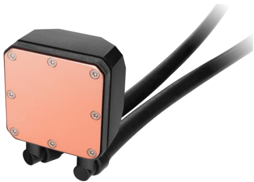
High Performance Water Block