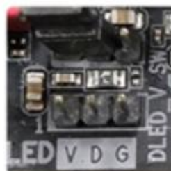
Digital Pin Header