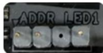
Addressable RGB LED Header