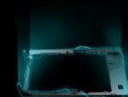
Anti Gravity Plate

A large copper base processed with anti-oxidation technology is adhered with both the GPU and DRAM to effectively absorb heat.