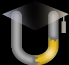
Composite Heat Pipes

The fins are meticulously molded with turning angles to serve a function of air deflector. This technology leads the air to channel through the fins more smoothly, and enlarges the contact area between the air and the fins.