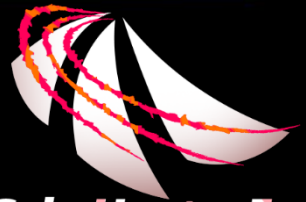
Gale Hunter Fan

Plug and party. Shine in consistency. Excellent compatibility guaranteed. No need of any software control, the board lighting can be easily synced with any other ARGB-supported devices with just a single cable.