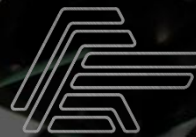
Exquisite Metal Backplate

Compact in size, strong in protection. The Anti-Gravity Plate with optimized size offers the strongest protection to the board, preventing the board from bending.