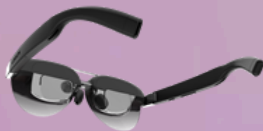
Legion Glasses 2 GY21R10234

Please click here to view the full list of accessories.