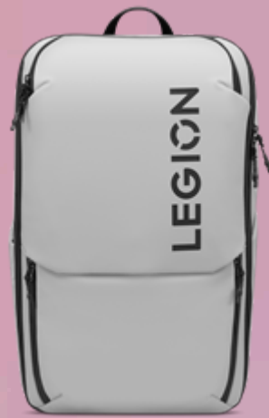
Lenovo Legion 17" Gaming Backpack GB800 (Light Gray) GX41U39300