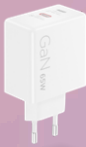
Lenovo Dual USB-C 65W GaN Charger GOA6065WEU