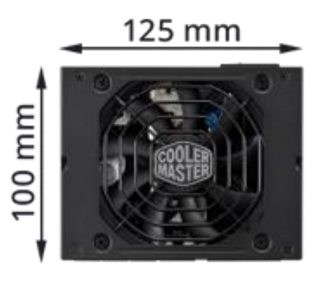
Compact SFX form factor

he ultra-compact dimensions of this SFX unit make it the perfect fit for a mini-ITX build.