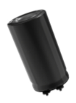
Silent and smart performance

This unit is certified to achieve more than 90% efficiency at typical loads.