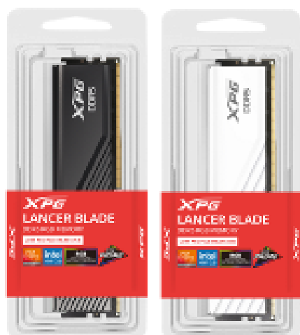
Single Tray Package