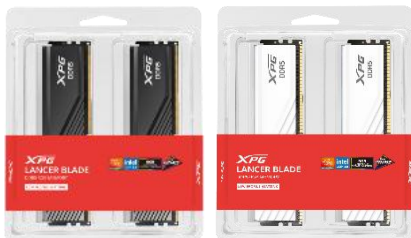
Dual Tray Package