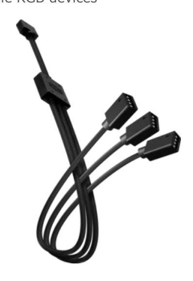
1-to-3 RGB SPLITTER (Bundled Accessory) Allows you extend to multiple RGB devices