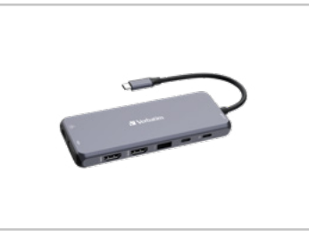
Right Side Angled