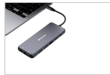
Right Side Angled Lit