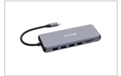
Left Side Angled