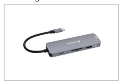
Left Side Angled