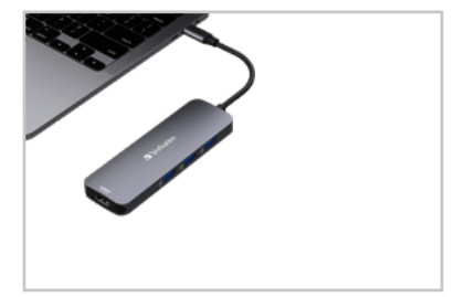
Right Side Angled Lit