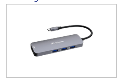
Right Side Angled