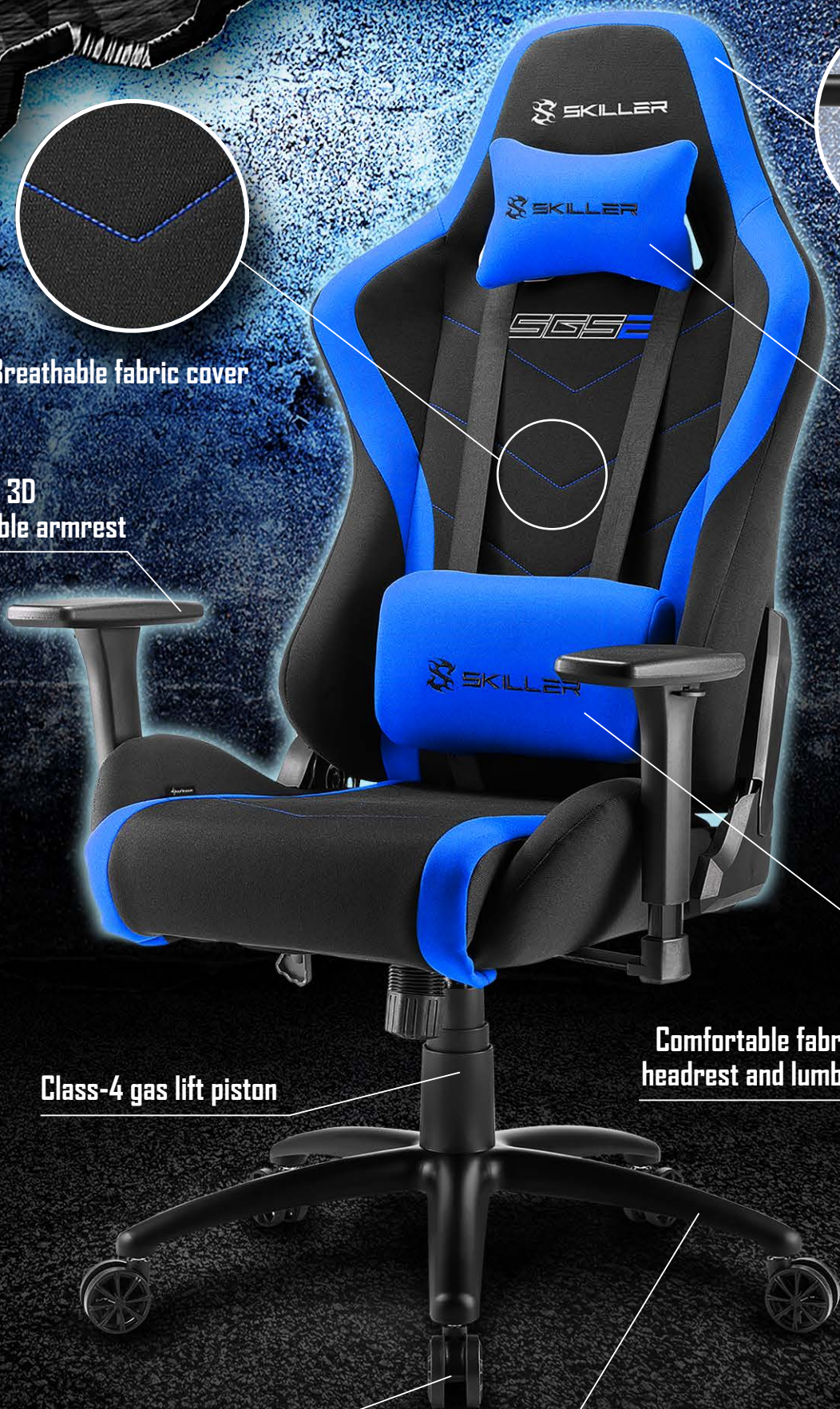
Robust steel five-star base