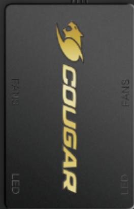
CORE BOX V2