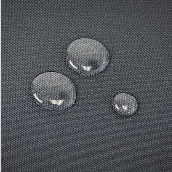
Splash proof fabric