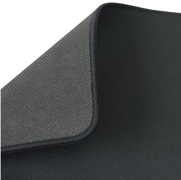
Anti-slip rubber base