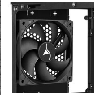
120 mm fan in rear panel