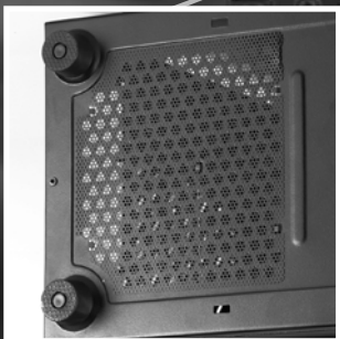
Bottom dust filter