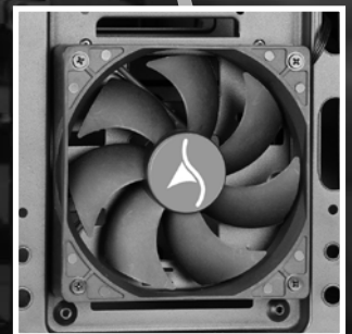
120 mm front fan mounting