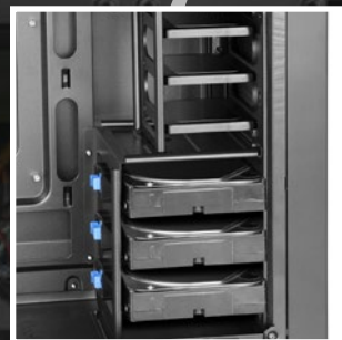
Easy SSD and HDD mounting