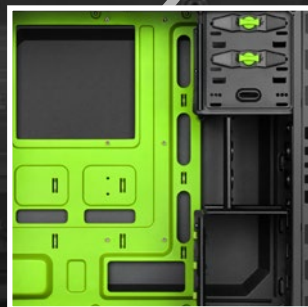
Cable management system